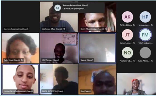
Youth participants during mentorship session, August 2021

Young people are central to the achievement of the Sustainable Development Goals (SDGs) as indicated in the United Nations' Youth Strategy 2030. Investing in youth through creation of opportunities for intergenerational collaboration and accelerating human development is critical. In response, the ACP MEAs 3 Programme launched a Youth Empowerment and Training Initiative (YETI), to engage with youth on key