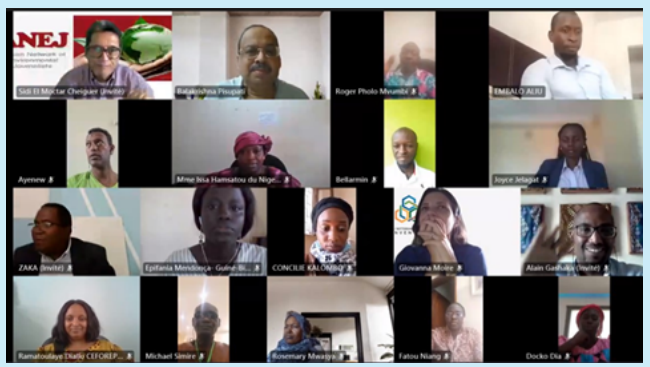
Participants during the UNEP-ANEJ Virtual Briefing Session on 6th July 2021

Equipping Environmental Journalists with the Knowledge and Skills to Cover Critical Environmental Governance Issues in Africa