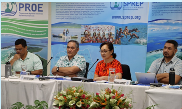
Delegates at the 11th COP Waigani Convention-SPREP

The Waigani Convention is concerned with banning importation into Forum Island countries of hazardous and radioactive wastes, and to control the transboundary movement and management of hazardous wastes within the South Pacific Region.