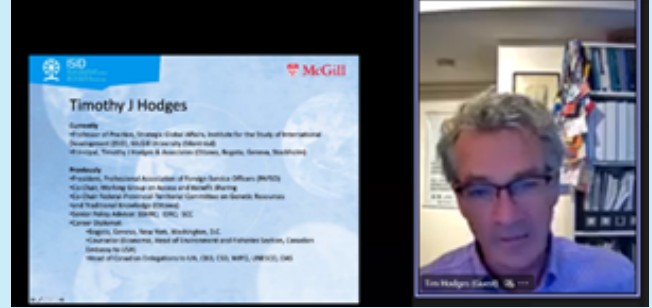
Timothy J. Hodges, Youth Biodiversity Mentor

The first batch of the Youth Empowerment Training Initiative has been rolled out in the Africa region. Prior to commencement of YETI, youth from existing environmental networks, embarked on online InforMEA courses on Biodiversity Convention, Environmental Governance as well as Environment and Human Rights. After the completion of the InforMEA courses, the youth engaged in YETI Mentorship programme where they are paired with renowned expects as mentors on Resource Mobilization, Capacity Building and Stakeholders Engagement on media and indigenous People and Local Communities (IPLC).