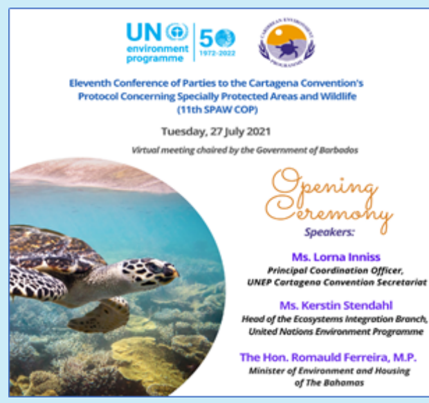
The 11th SPAW COP Cartagena Convention on 27th July2021

The week-long meetings, which were held virtually for the first time due to the impacts of the COVID-19 pandemic, commenced with the 5th Conference of Parties (COP) to the Protocol Concerning Pollution from Land-Based Sources and Activities (5th LBS COP) on 26th July 2021, followed by the 11th COP to the Protocol Concerning Specially Protected Areas and Wildlife (SPAW) on 27th July 2021.