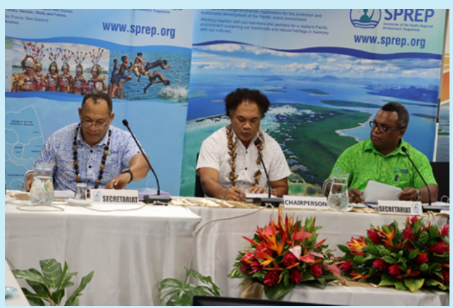
Senior SPREP Official during the 16th COP Noumea Convention

A meeting of the Sixteenth Conference of the Parties (COP) to the Convention for the Protection of Natural Resources and Environment in the South Pacific, known as the Noumea Convention, was officially convened on 2nd of September 2021, with Parties and Observers joining virtually.