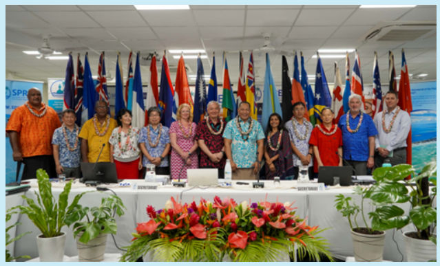
Delegates during the 30th SPREP Meetings of Officials

"Accelerating Actions for a Resilient Blue Pacific" is the theme that the 30th Meeting of Officials of the Secretariat of the Pacific Regional Environment Programme convened from 7-9 September 2021. The meeting was hosted by SPREP via virtual platform that brought together 21 Pacific Islands and 5 Metropolitan Member countries to discuss strategic programmes and governance issues pertaining to the organization, as well as to approve the 2022-2023 work programme and budget.