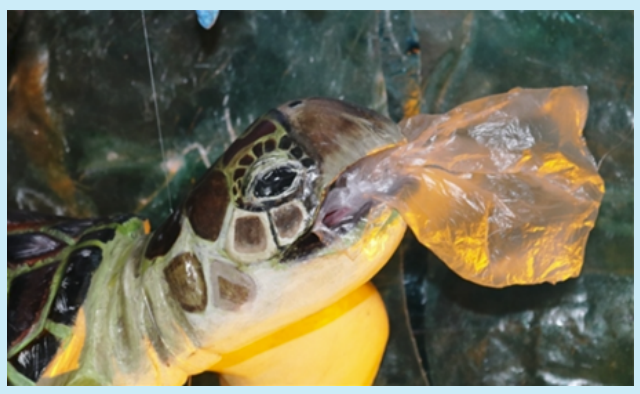
Artwork on display at the CMS COP12.

On 10th of September 2021, Pacific Environment Ministers and High-Level Representatives gathered virtually to participate in a "Talanoa" (dialogue) to discuss some of the pertinent key priority issues bearing direct impact on responsive and pragmatic actions for a resilient Blue Pacific.